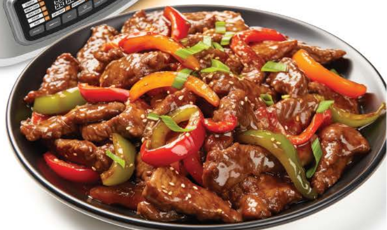
[Stir Fried Beef] 8 Minutes