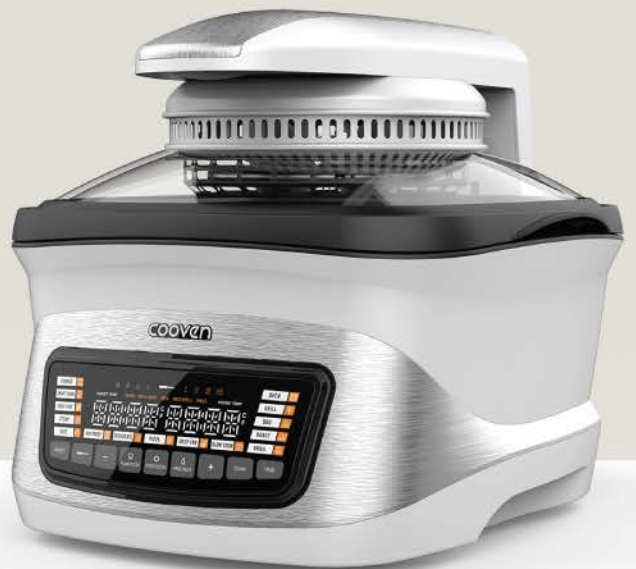
Digital Multi Oven