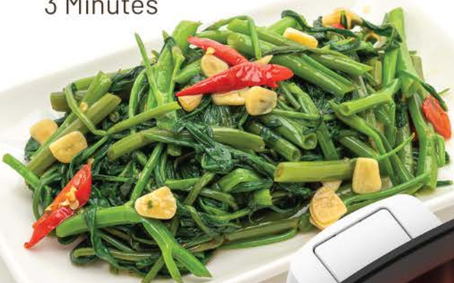
[Stir Fried Kangkung] 3 Minutes