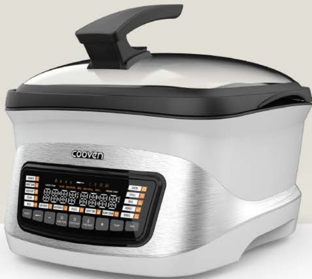
Digital Multi Cooker

All-in-one Culinary Master Complete Cooking Solution