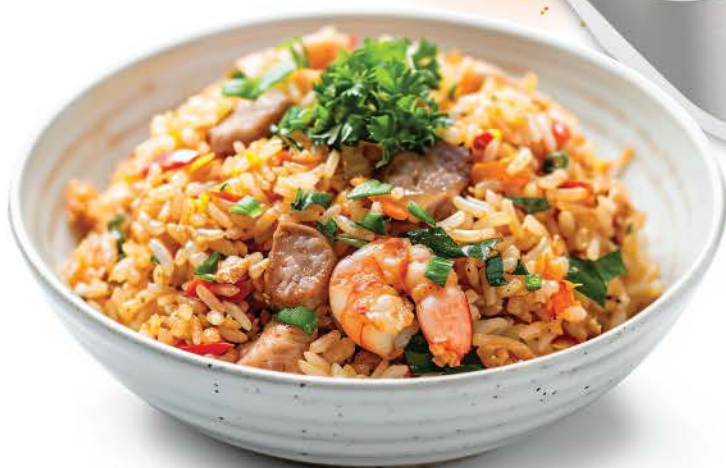
[Fried Rice] 8 Minutes